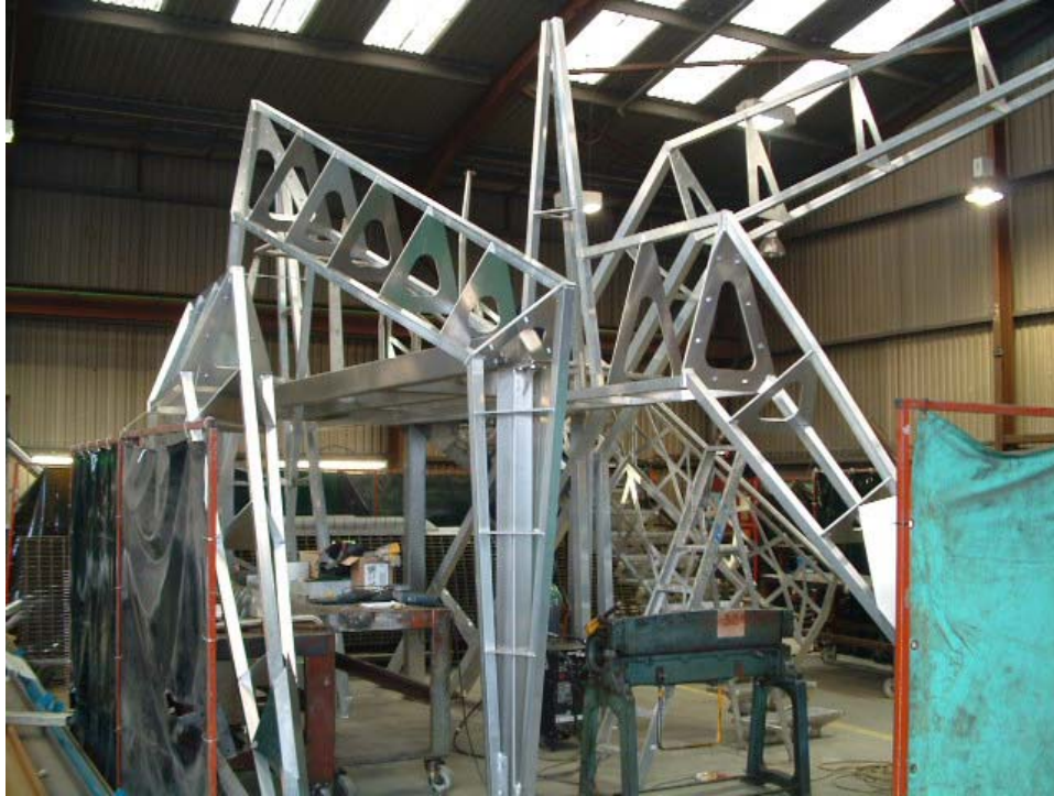
Figure 4: Fabricating the stand in the factory

On reflection then, there was thus perhaps a missed opportunity for the students to continue in a limited 'Architects' role, taking an advisory position to help further communicate their vision and concept. The benefits would have been mutual; the students would have benefited from having a greater involvement in the detailed design process while the client would have benefited from continuing creative input.