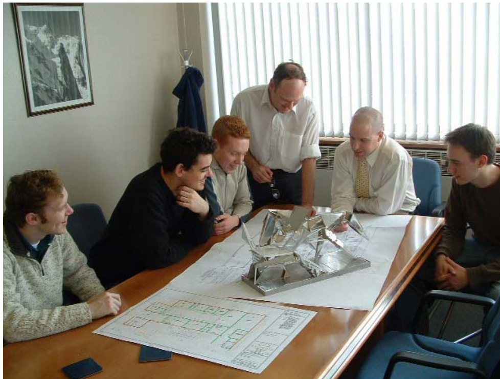
Figure 3: Design development meeting, industrial partner and students

From a tutor perspective, it was very rewarding to see this motivation evolve. The tutor’s thoughts on the project echo those of the students – that the tutorial process was a much more relaxed, less ‘us and them’ affair and that the whole project took on an energy that was perhaps greater than that deserved through its contribution to the curriculum grading structure. Each group clearly wanted to win the competition, and see their design built, and thus the level of personal engagement in the project from each student could hardly have been higher. The consequential increased learning – e.g. the need for, and techniques of, rapid experimentation – flowed from this high level of engagement. For the winning students both the rewards and consequential learning was extended, as they moved forward with the project to see it fabricated, built and used.