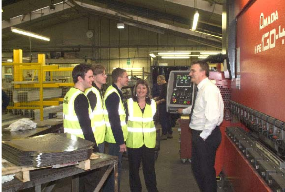
Figure 1: Factory visit: students

The factory visit was conducted in small groups throughout the first day of the project; it allowed the students an important insight into their client's design aspirations as well as providing a direct exchange between students and a comprehensive technical knowledge base. Small group numbers provided greater staff/student ratios further assisting effective learning. Together with seminars the initial programme provided the students with technical support as well as a sense of enthusiasm for the project.