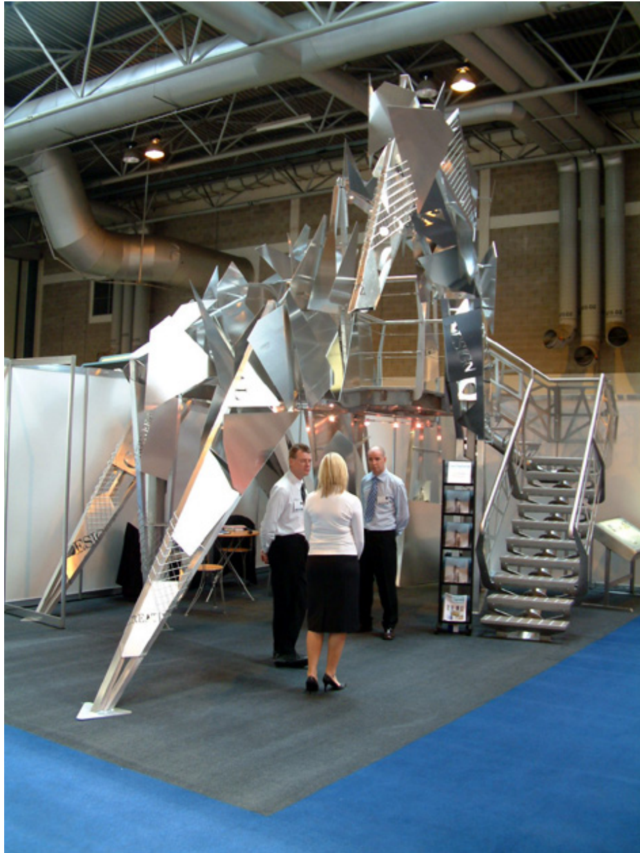
Figure 5: Completed exhibition stand at Interbuild 2004