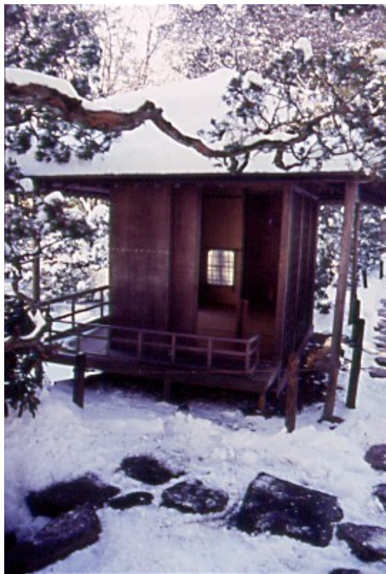
Figure 4: Teahouse at Nikko Shrine, Japan

between object and space, action and inaction, sound and silence, movement and rest' (Nitschke, 1993, p 56). This sense of the in-between is highly valued throughout the Japanese arts, as evidenced in No theatre, in which the performance depends as much upon the pauses between sounds and movement as it does upon the things themselves (Nitschke, 1993). It is also reflected in the Japanese custom of flower arrangement ( ikebana ). While Western interpretations of ikebana typically focus on the flower as ornament, in the Japanese tradition it serves to give depth to the shadows created between the flower and the wall or within the alcove where it is sited. As Tanizaki (2001, p 46) relates, 'we find beauty not in the thing itself but in the pattern of shadows, the light and the darkness, that one thing against another creates.'