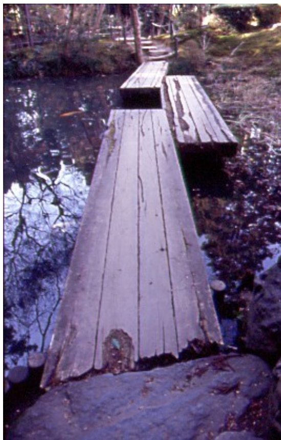
Figure 3: The aesthetic of wabi-sabi; footbridge at Nanzen-Ji Temple, Kyoto, Japan

Wabi-sabi is based on an understanding that truth, and thus beauty, can be found in nature (Koren, 1994). This belief has its origins in part in the desire Japanese people traditionally have had to merge and live in harmony with nature, and is grounded in the values of Shinto, whose essence is respect for nature (Terazono, Matsunori, Shrine Master of Achihayao Jinjya , 2004, interview with author, 1 August). The beauty and diversity of the landscape itself, and the distinct qualities of seasonal changes in Japan, have also led to the Japanese people being sensitive to nature's features (Hiroto 1971, p 26). [Images of Japanese television news reporting on the forecasted arrival of the blossoming of cherry trees in the spring, and the subsequent rush to the parks to picnic under the blossoms once they emerge, are just one contemporary illustration of the Japanese people's affinity for nature.]