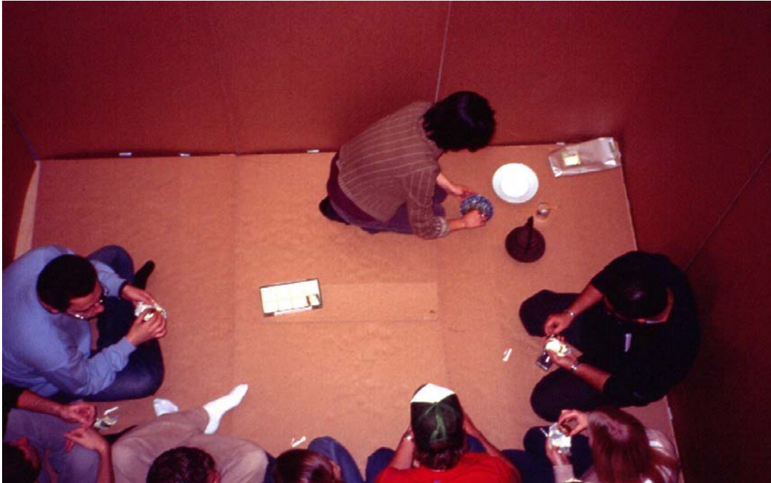
Figure 2: Students participating in the tea ceremony (chado)