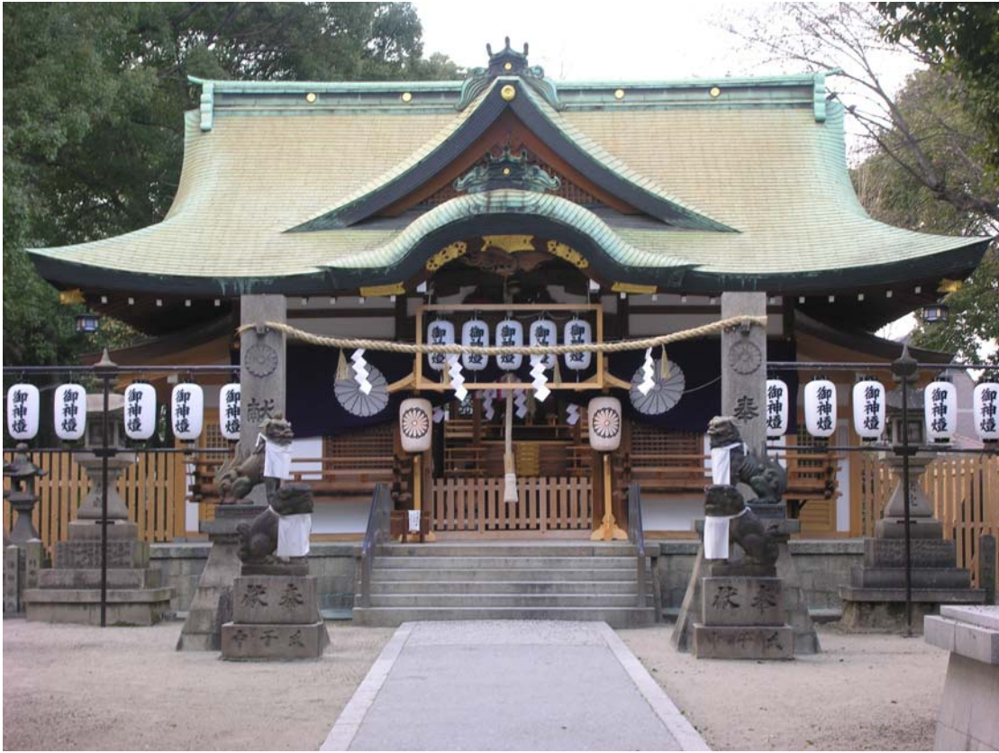
Figure 1: Main hall (haiden) at Achihayao Jinjya, Osaka, Japan

To consider how these aims were achieved, and in particular how student learning was enabled by exploring one subject through another, this paper will discuss: